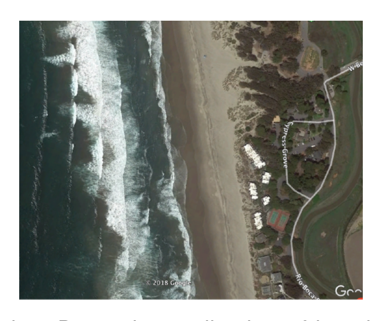
Pajaro Dunes is a collection of beachfront condominiums and houses located on Monterey Bay.

It was our beach location with the family after we moved to the West Coast. It has several miles of beautiful sandy beach and multiple homes that we could rent for a week in the summer.